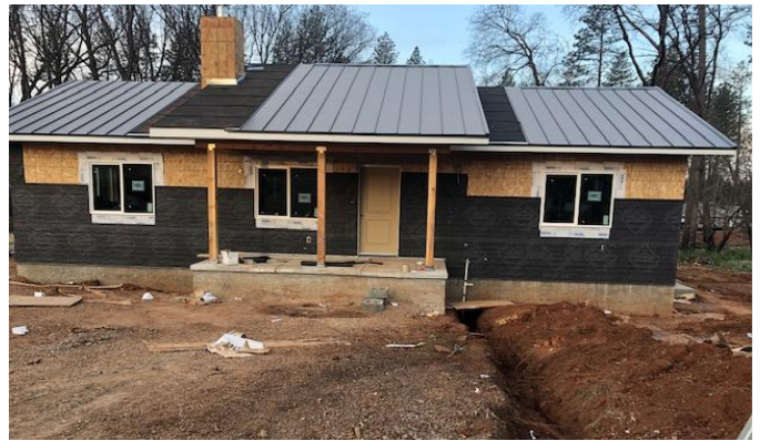
Figure 2. Street view of the rebuild under construction

"The AER incentive has helped offset the cost to make my new home more energy efficient. The program has been easy to navigate with help from everyone involved. I'm looking forward to getting back home and starting my next chapter in Paradise."