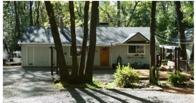
Figure 1. Street view of the original home

Following her enrollment in the AER program, the homeowner shared program information with the local school district to help spread awareness about the incentives in her community.